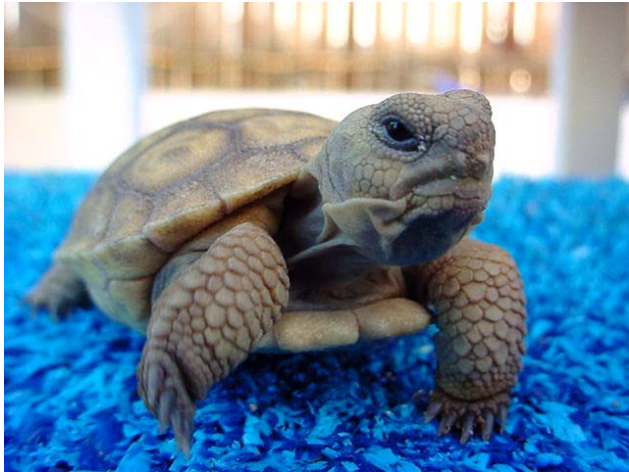
Scooter started right out on MegaDiet and is now a healthy 6 years old.