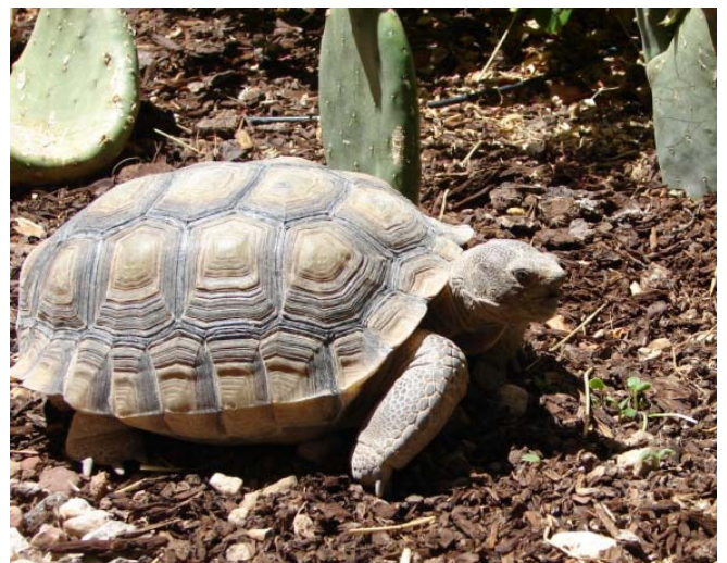
Homer zeros in on those tasty cantaloupe sprouts.