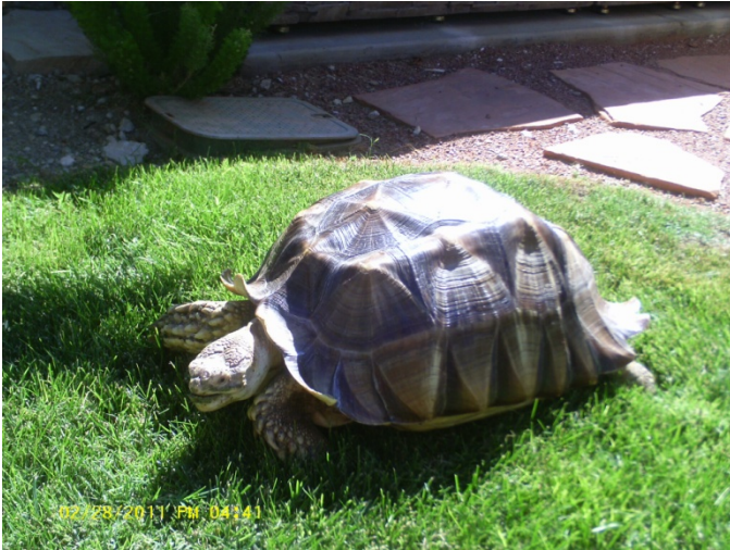
Honu, a sulcata, looking good today! He passed a bladder stone.