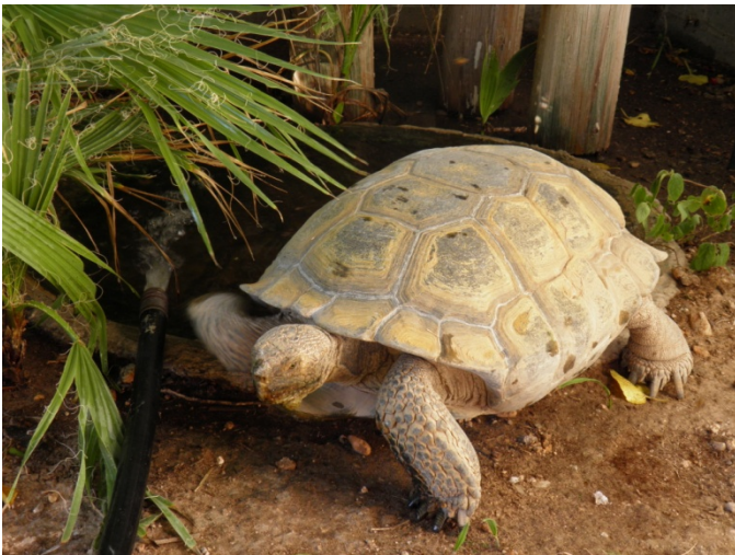
"Suitcase" stands ready to go. His name says that he has everything he needs right inside his shell!

We can check any animal for Salmonella. Typically, we culture the feces. HOWEVER, we generally do not encourage testing of reptiles. Why not? Because we assume that most reptiles are carriers of Salmonella.