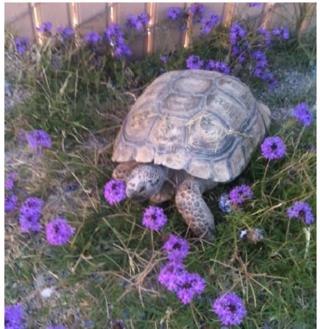
Murphy browses in a field of flowers.

A combination of sun angle and temperature tell your tortoise when its time to brumate. It will begin to come out less often and also eat less. Your tortoise knows its schedule and what's right. It will enter brumation some time between mid September and early November. Each tortoise has its own schedule. Mark down the last date you see your tortoise so you'll know what to expect next year.