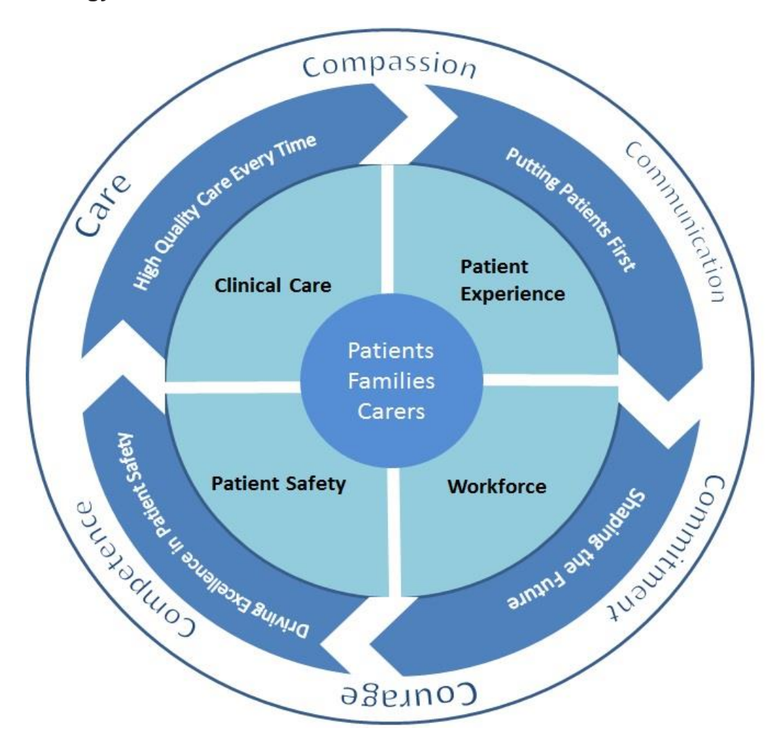
Figure 1: The four key ambitions in Gateshead's health nursing and midwifery strategy

The standards have been adapted for clinical areas requiring bespoke measures, with additional variation sheets. These include: