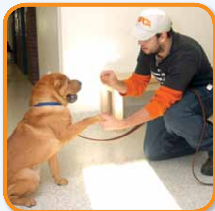
ASPCA team member evaluating a new arrival.