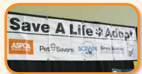
Spokane Community Partners held a successful event at the County Fair.

In September, four Spokane community partners once again co-hosted a large booth at the Spokane County Fair. Thousands of people visited the booth during the fair's 10 days, meeting animals available for adoption, learning about the life-saving services each agency provides, and spinning a prize wheel to try their luck at a gift for their own furry friends. The event raised more than $2,500 in donations. In addition, Spokane adoption shelters held a fee-waived adult cat promotion for three days in October. The promotion was a resounding success, with 400 percent more cats, 300 percent more kittens and 100 percent more dogs being adopted than during the same weekend in 2008. The shelters literally ran out of cats and kittens for adoption—a first! ■