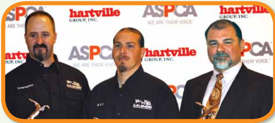
Some of the brave heroes who helped lead the largest crackdown on dog fighting in U.S. history.