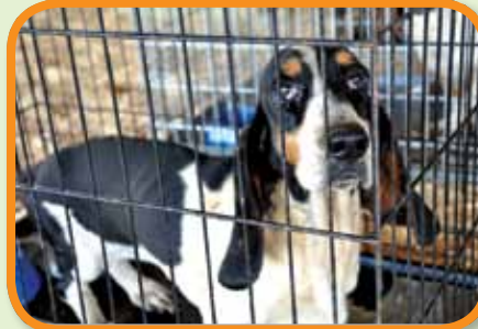
One of the many emaciated dogs rescued from the Memphis Animal Shelter.