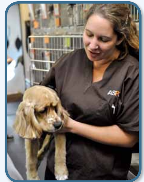
Spaying/neutering helps end the tragic euthanasia of adoptable animals.