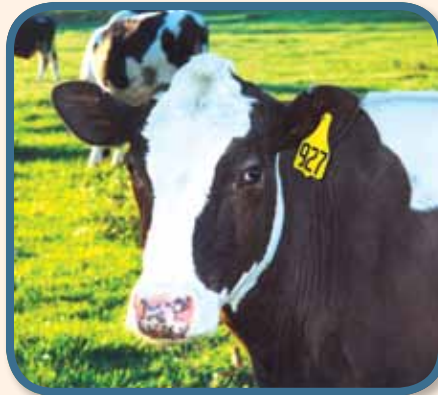
The ASPCA applauds California for banning the tail-docking of dairy cows.

The California State Legislature passed three ASPCA-supported, animal-related bills, which were then sent to Governor Arnold Schwarzenegger for approval or veto. Governor Schwarzenegger signed SB 135 into law, banning the tail-docking of dairy cows. Docking the tails of cows requires the amputation of up to two-thirds of the tail. This cruel and unnecessary procedure, which is opposed by the American Veterinary