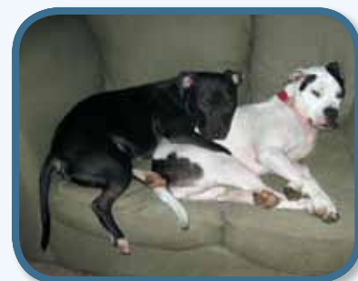
Lucy and Lincoln—two peas in a pod.

I'm a high school teacher and was returning to school one day when I saw a Pit Bull walking down the street. He was emaciated, starving to death. I called to him, and he turned and looked at me with the most defeated look. I got down and used my voice to coax him to me. He responded by getting down on his belly and crawling towards me, his tail wagging. That's when I knew he was going to be mine. I scooped him up, placed him in the back of my car and drove to the nearest grocery store to purchase food for him. I fed him right there in the back of the car and watched as he furiously ate what he probably thought would be his last meal. His belly full, a new feeling of security allowed him to fall asleep. I drove to my vet, and they found that he was suffering from a serious case of mange. They also told me that he probably would have been dead in a week from starvation. I brought him home to meet my Pit Bull, Lucy, whom I also rescued from the streets. I decided to name him Lincoln because I found him on Lincoln Street. Since then, Lincoln has gained 30 pounds, and is a happy, healthy pooch who loves all people and other animals. Lincoln is very popular in the neighborhood, especially with kids. It just amazes me how resilient dogs are. They don't feel sorry for themselves or dwell on what has happened in the past. Lucy and Lincoln are now two peas in a pod, and I am ecstatic that I was in the right place at the right time. ■