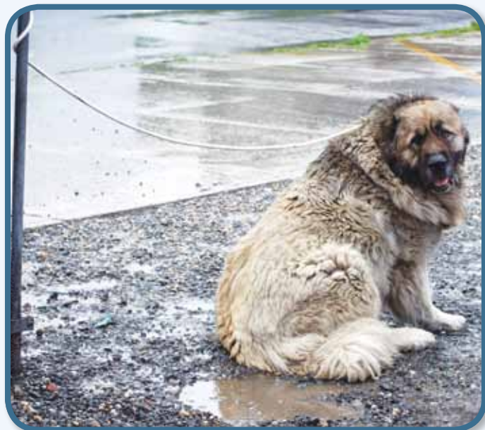
Help us prevent animal cruelty. Learn to recognize the signs of abuse!