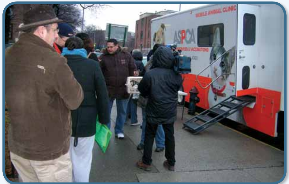
Our fleet of five fully equipped mobile veterinary clinics provides countless numbers of life-saving surgeries.