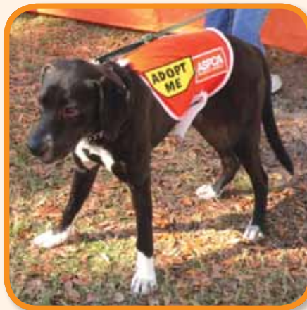
Hundreds of animals found forever homes at Tampa's Pet Adoption Expo.

The Tampa community partners held their semiannual Pet Adoption Expo, sponsored by the ASPCA, at the State Fairgrounds on November 14. That day, 408 pets (297 dogs, 106 cats and five rabbits) were adopted. More than 60 shelters, rescue groups and vendors were on hand to participate. The Humane Society of Tampa Bay, Hillsborough County Animal Services, and No More Homeless Pets Hillsborough County/TampaPets.org have collaborated on six one-day adoption expos from 2007 through 2009, resulting in a total of 1,955 pet adoptions. In spite of the economic challenges facing Florida, adoption numbers have continued to increase at this event and throughout the year. ■